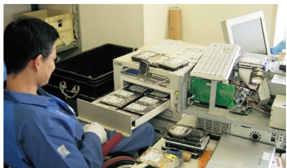
Data erasure operation using magnetism

We provide a data erasure service at our Recycle Centers located in Saitama, Chiba, and Amagasaki for the sake of countermeasures against data leaks accompanying the disposal of computers, thereby contributing to personal information protection through our business.