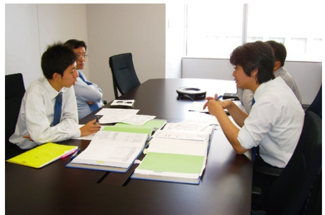
Internal Control Project (State of Progress Hearing)

In September 2006 we set up "Project Teams Handling Internal Control," which are centered around representative members from each division, and also established a management system which complies with the Japanese version of the SOX Law throughout the entire Asahi Pretec Group.